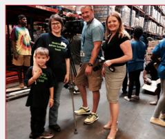
CASE for Kids Food Bank Event Featured on KTRK Channel 13 Houston Live pg. 5