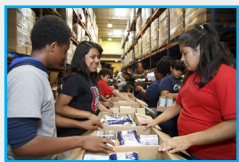
Food for Thought: CASE for Kids Afterschool Students Gain Life Lessons from Volunteering at Food Bank pg. 4