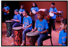
CASE for Kids Hosts Student Performances at Hobby Center pg. 2